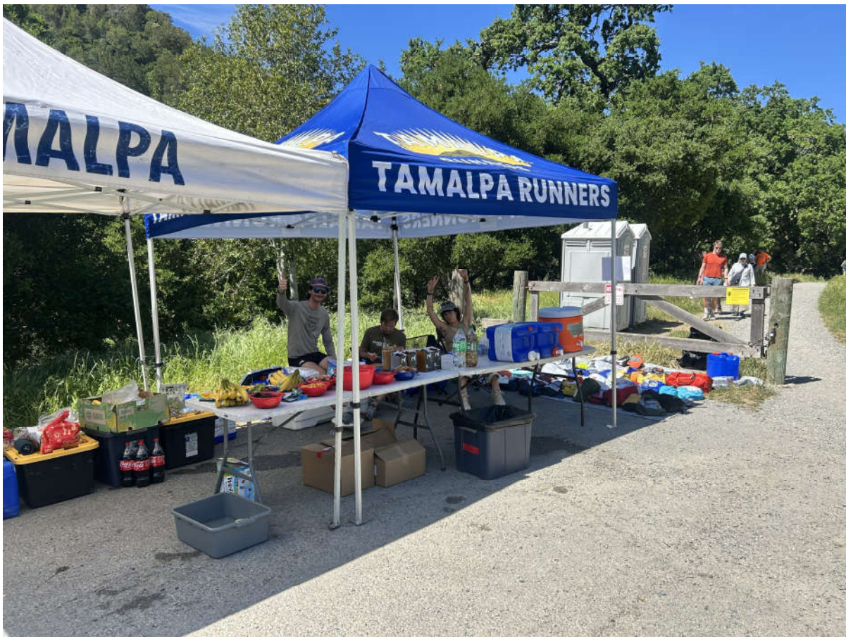
Tamalpa's Aide Station at Mile 50 at the Big Alta 100K

If you want to go for a run first, along the shoreline trail and levee, meet at 4:30. Cheers!